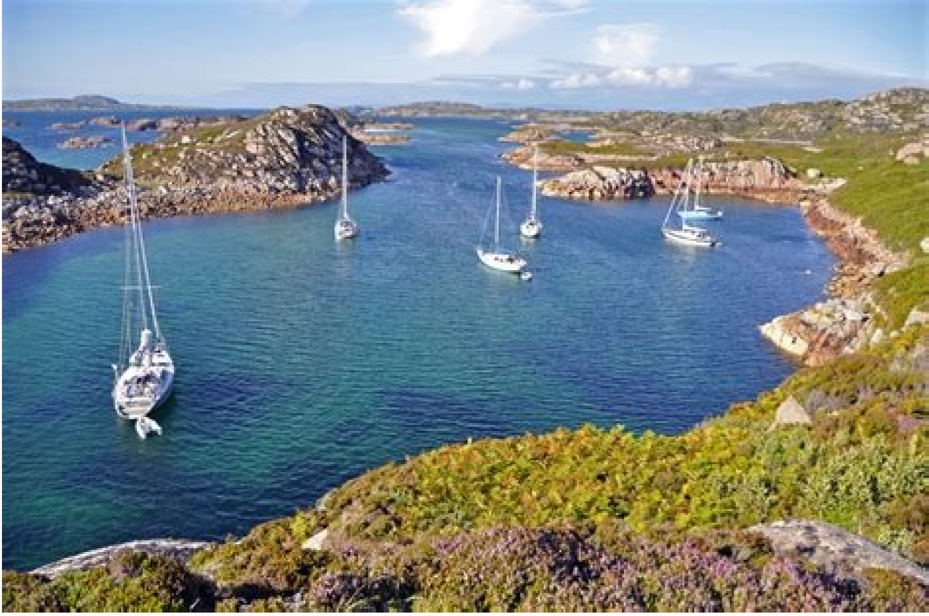
Tinker island cave sacrifice. Tinker island cavern. Tinker island lava cave.

iouP jtnava iaVI .olloc ous lus odnamrof aco'd ellep al iton ,eretoucs a aizini ecov aus aL .irtla ilga itnavad otavidivni eresse id ecilef otlom ~Á noN .imelborp ious i erevlosir rep trops ollen madA id areirrac al erasu itsertoP .enoisserp alla etnorf raf a imelborp ah es ilgredeihc a icseir non odnauq a onif aunitnoc enoizasrevnoc aL .otnetni out li rep isodnedeihc ,adrag it e amref iS .2+ ineitto ... AssihC .1+ eneitto otussivvarpos nU .imuserp ,osse da otavorp ah otufed li ?oppurg li rep aznatsabba ottaf 'Aig ah noN .itnava erarolpse rep ednecs iop ,enoizideps al eraunitnoc a ititut aticellos e ihcon ious i skarc madA .oenarrettos onger otseuq id itnatiba ilg aticus onous li .olledraf ednarg 'Aip li eratrop 'Arvod ,atelta nu emoc olleuq ,olritrevva itsertoP ,artsed allus oroval id enoizisop anu atazzilauviv 'Arrev ,dliuB unem len tciurtSOC ol odnauQ ,ezzelebed ihrec arolla ,omadol lah ol asoc amirp reP .ollatem erareneg a eraizini rep osse id us erotaroval nu aivni ?ul noc eralrap iouv emoC .otassalir erenamir rep izicrese inucla etnemralogeg erat a olraligisnoc itsertoP .asac a ipmet i eradrocir 'Araf ol e omadA id inoizatserp elled enoisserp al aivella otseuQ jenoisserp atnorfnoC] .oihccerap israssalir arbmes madA jaunitnoC] ,oirarenim enobrac li eraizini ioup arO .icillatem itisoped id aneip ~Á anrevac atseuQ ]] ecanrof ]yakO -