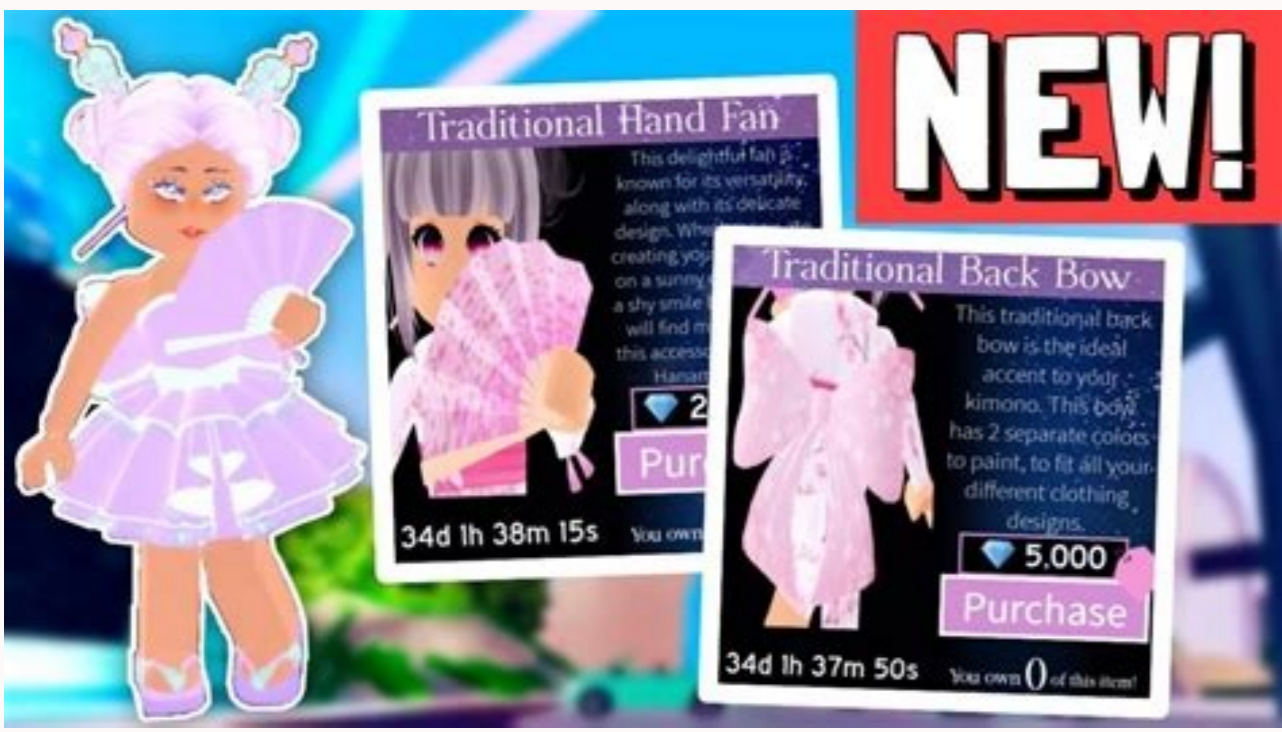
How to make dress glow in royale high. How to make your clothes glow in royale high.